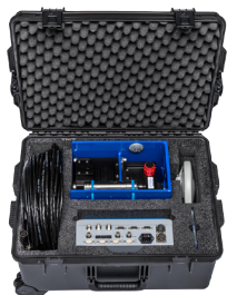
Integrated solution packages in one Pelican™ case