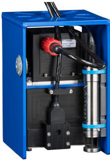
Integrated multibeam solution with IMU and SV probe