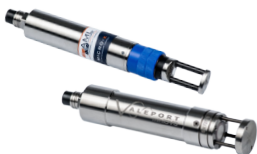
SV probe from Valeport or AML