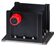
IMU: Integrated Inertial Navigation System (I2NS)