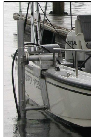
Figure 1: Typical over-the-side mount

When the pole is in the 'up' position it should be secured so that there is no or little movement that would be strain on the flanges or mount. The head should be washed with fresh water as soon as possible and inspected for any damage or marine growth. If the head is to remain in the 'up' position a covering should be put over the head that will protect it from the sun.